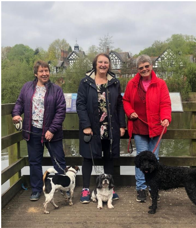
Walking with dogs in Worsley Woods.